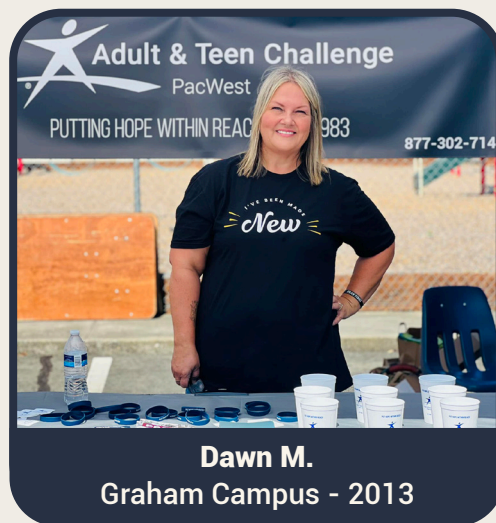
Dawn M. Graham Campus - 2013